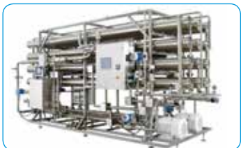
INDION ® Integrated Dye Desalting, Water Recovery & ZLD System

* In collaboration with Rochem Group S.A.