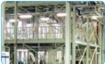
INDION ® Multi-Effect Evaporator (MEE)

Ion Exchange (India) Ltd. offers a complete portfolio of advanced environmental products, solutions and services for industrial, institutions and municipal segments. Technology solutions encompass water, liquid, gaseous effluents, solid waste, bio-solids and renewable energy, while services include consultancy, turnkey contracting, O&M and BOOT projects.