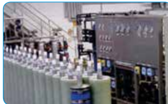
INDION ® Plate Frame (DT/PF) RO system*

* In collaboration with Rochem Group S.A.