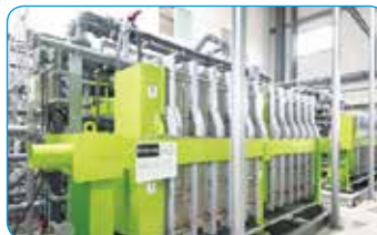
Electrodeialysis Reversal (EDR)

* In collaboration with ASTOM ACROPL Corporation